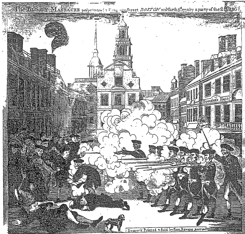
Figure 10-13 This engraving of British troops firing on helpless people during the Boston Massacre was created by Paul Revere. It appeared in a pro-American broadside, The Boston Gazette . How might a loyalist broadside report the same event?

When the Quebec Act was passed in 1774, all the colonies sent delegates to the First Continental Congress, in Philadelphia. The Congress took the first steps toward full independence from Britain. The leaders soon demanded a boycott of all goods from England, cutting economic ties to the home country. British General Gage readied the thousands of British troops from his headquarters in Boston, and the rebellious colonists began to train and to store weapons and ammunition.