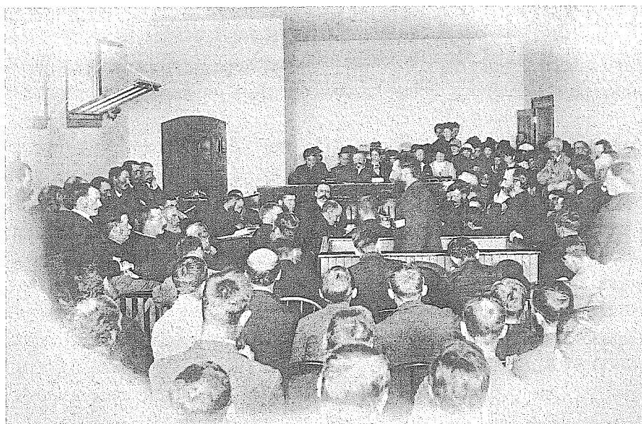
FIGURE 5-22 Louis Riel (standing, centre) addresses the judge at his trial. Do you think Riel should have been tried for treason? Why or why not?