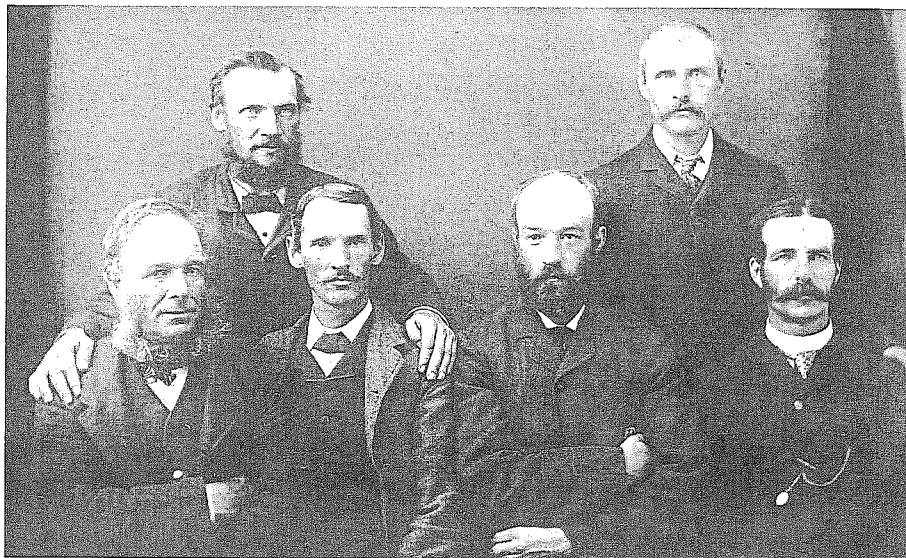
FIGURE 5-21 The jury for Riel's trial. Although over 30 men received summons to be part of the jury, only one spoke French. Riel was tried by a jury of English and Scottish Protestants. How do you think the trial might have turned out if Riel had faced a jury representing all peoples of the Northwest?

When Riel's lawyers attempted to have all the Métis petitions admitted into evidence, the judge refused.