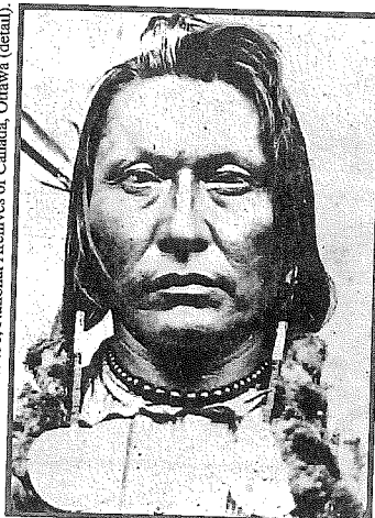
(detail)

Big Bear was very unhappy with the federal government's treatment of the First People and hoped that threats of a resistance would make the government take notice. He did not want to take part in a confrontation; he wanted to resist peacefully. But when his followers took up arms, as their leader he took responsibility for their actions. He was sentenced to three years for his