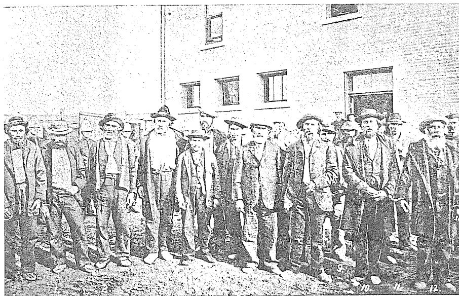
FIGURE 5-23 After the uprising was over, the government captured and charged more than 200 people, including these Métis and First Nations prisoners. What was the basis of a treason charge against people who had not been treated as citizens by the government?

It would take decades of struggle and determination for both the Métis and the First Nations to regain a measure of respect from the rest of the Canadian population. This struggle continues to this day.