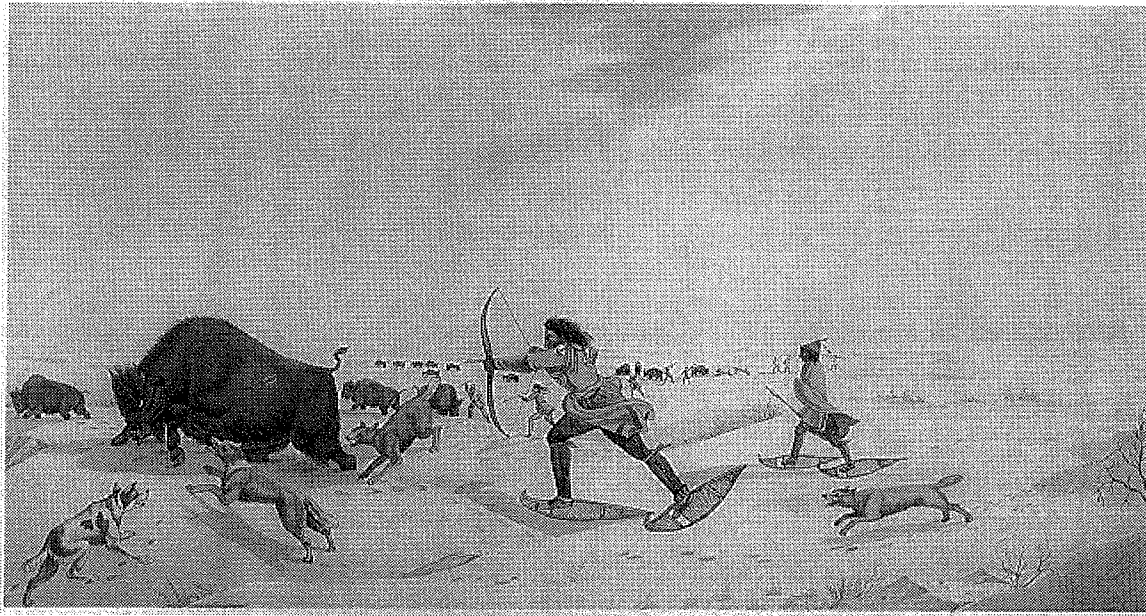
Peter Rindisbacher, Indian Hunters. Pursuing the Buffalo in the Early Spring, 1824 or earlier

timber to overseas ports, and bring back cargoes of immigrants on the return voyage. The technologies used by these populations helped to take advantage of the natural environment, creating the particular economy of British North America: an economy based largely on the land, but increasingly involved with simple industrial production and more complex international trade.