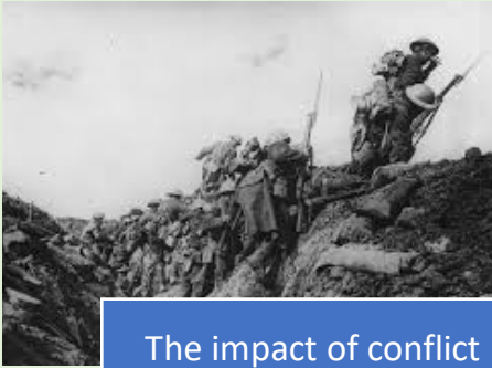
The impact of conflict