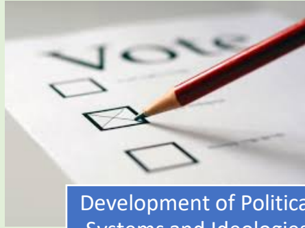
Development of Political Systems and Ideologies