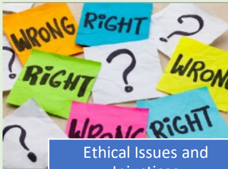
Ethical Issues and Injustices