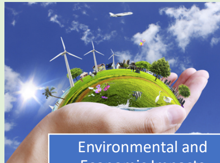
Environmental and Economic Impacts