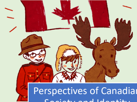
Perspectives of Canadian Society and Identity