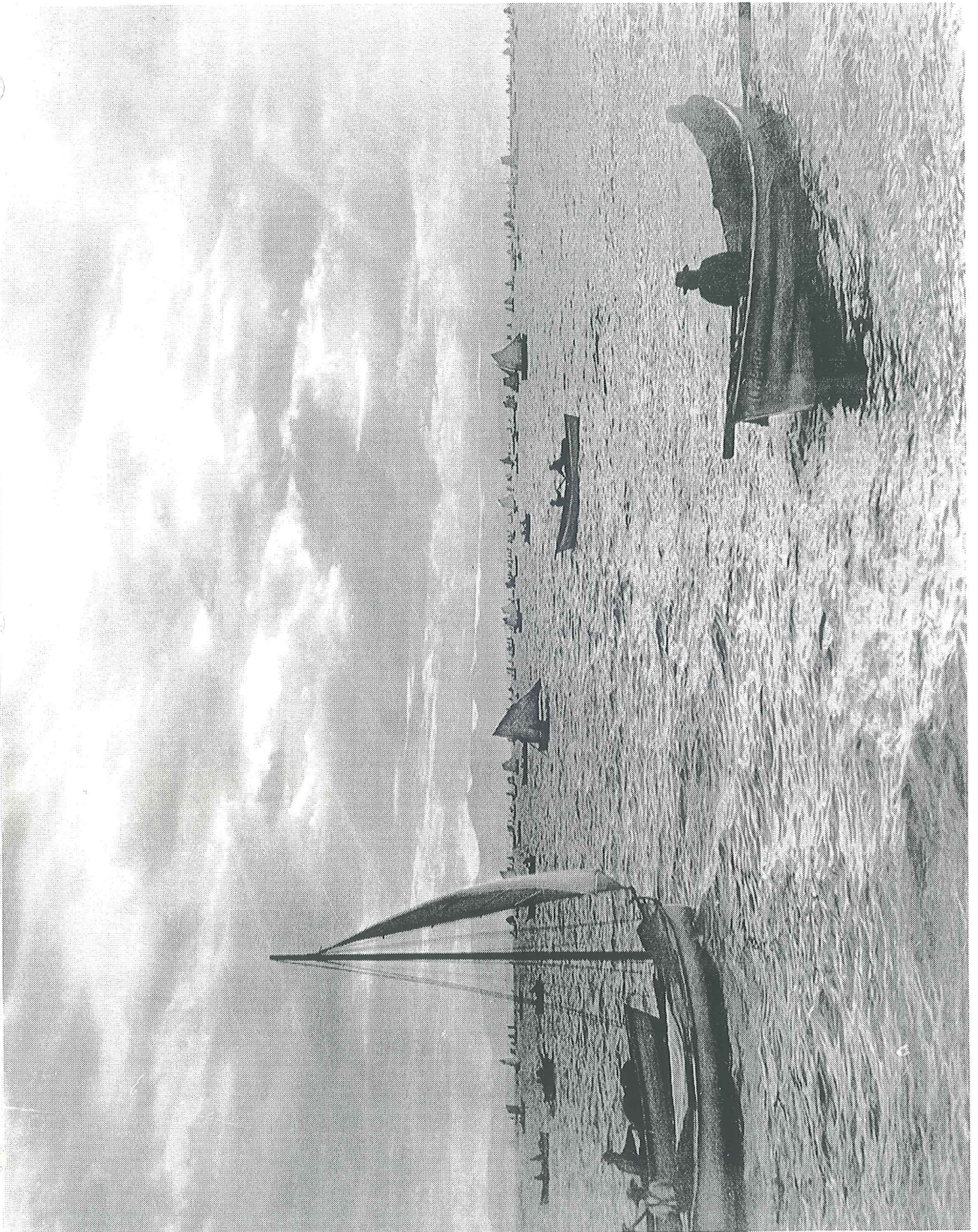
Fishing fleet at the mouth of the Fraser River.