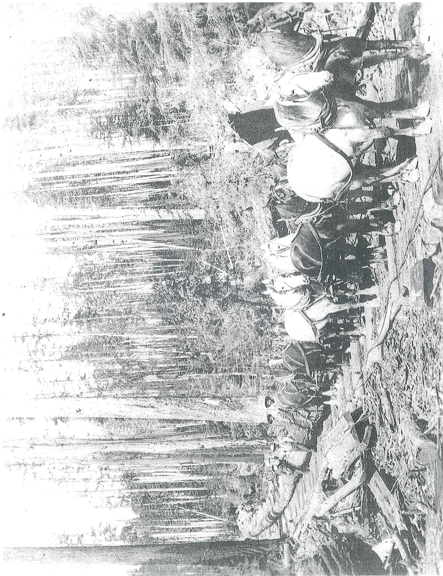
Team of horses hauling logs on skid road, 1904.